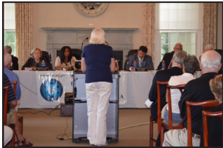
A public witness testifies during the hearing in Docket No. 2014-346-WS in Daufuskie Island, SC.