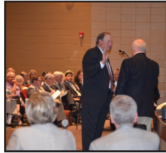
A public witness is sworn in before delivering his testimony during the hearing in Docket No. 2015-20-E.