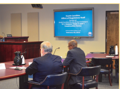
Presenters during the ND-2014-7-E Allowable Ex Parte briefing.

In honor of the American Heart Association's National Wear Red Day in February, the PSC sported their RED to bring awareness to the disease affecting millions of Americans each year.