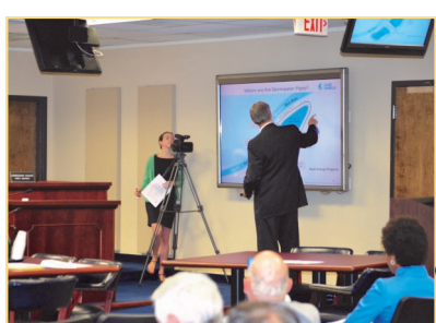
A presenter discusses stormwater pipes during the DN-2014-8-E Allowable Ex Parte briefing.