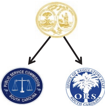
Act 175 created the Public Utilities Review Committee, who oversees the PSC and ORS.