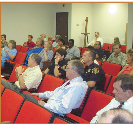
This picture, taken during a PSC staff gathering in December 2000, includes employees whose functions left the PSC with the passage of Act 175 of 2004.

Act 175 impresses a strict ethics policy on the Commissioners and staff of the PSC, which are all bound by the Code of Judicial Conduct. The requirements of Chapter 13 of Title 8 of the SC Code of Laws ensure the PSC upholds its integrity and delivers fair and reasonable outcomes in its utility regulation. The implementation of Act 175 over the past ten years can be accredited to the combined efforts of PURC, ORS, and the PSC.